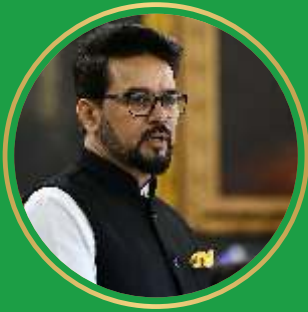
Shri Anurag Singh Thakur Chairman of Parliamentary Standing Committee on Coal, Mines and Steel