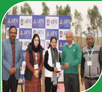
NATIONAL FARMER'S DAY

The students of faculty of Aarni University came together to celebrate the vibrant festival of Lohri with great enthusiasm and zeal. The event was marked by traditional folk dances, music and a bonfire, symbolizing the triumph of light over darkness