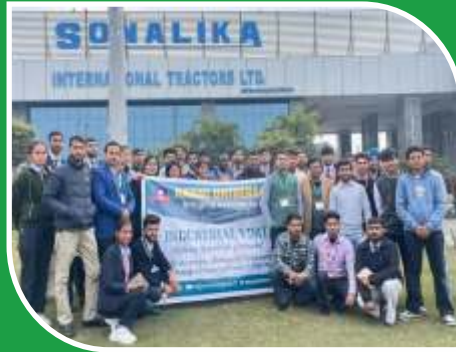
Management Deptt Visit Sonalika