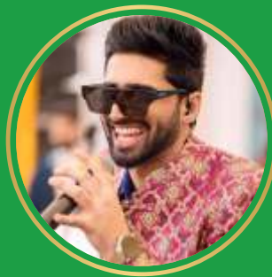
Shivjot Punjabi Singer