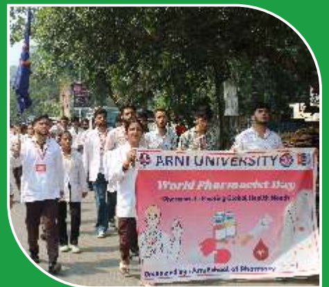
WORLD PHARMACIST DAY