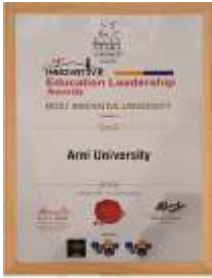
"MOST INNOVATIVE UNIVERSITY" Award