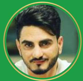
Kulwinder Billa Famous Punjabi Singer