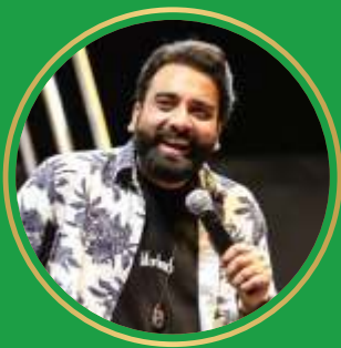
Anubhav Singh Bassi Actor and Youtuber