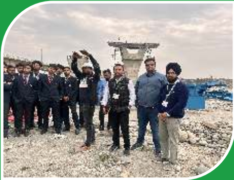
Industrial Visit By Students of Civil Engineering