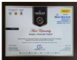
"PRESTIGIOUS INSTITUTE" for Valuable and Exemplary Contribution to the education community