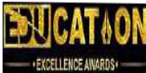
"EDUCATION EXCELLENCE" Award from Kiteskraft