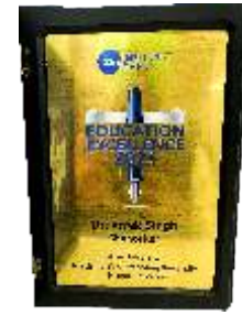
"EDUCATION EXCELLENCE" AWARD 2024