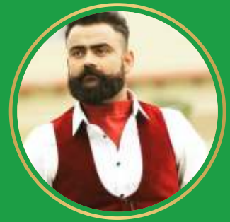
Amrit Maan Famous Punjabi Singer