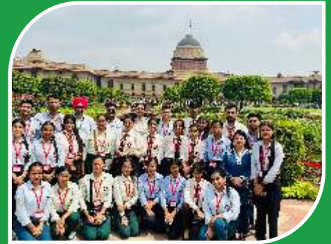
Rashtrapati Bhawan Visit New Delhi