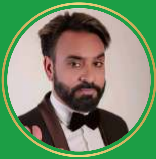
Babbu Maan Indian Singer Song Writer and Music Director