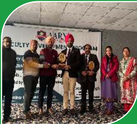
FACULTY DEVELOPMENT PROGRAM