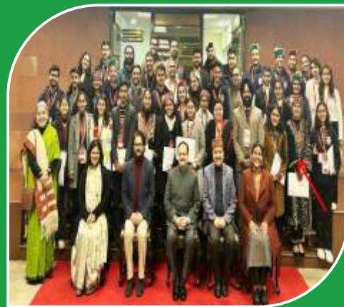
National Youth Mahostav