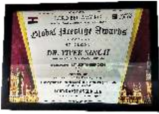
"INDIAN PIONEERING THE PATH OF VIKSIT BHARAT 2047" Award