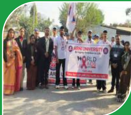
INTERNATIONAL AIDS DAY