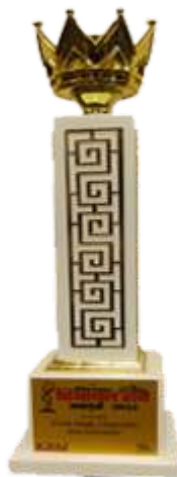
Award 2022 "DAINIK BHASKAR"