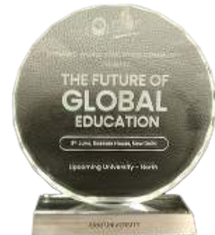
"BEST UPCOMING UNIVERSITY - NORTH" the Future of Global Education by Dynamic World Education Community