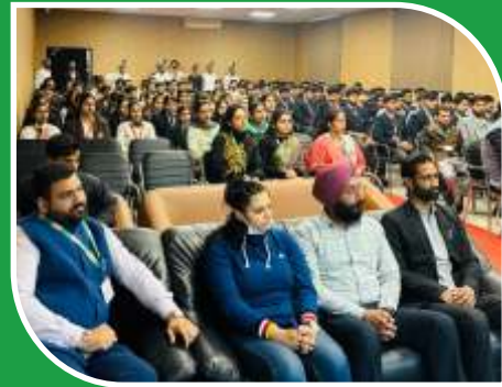
Workshop on TB Awareness By Amandeep Hospital, Pathankot