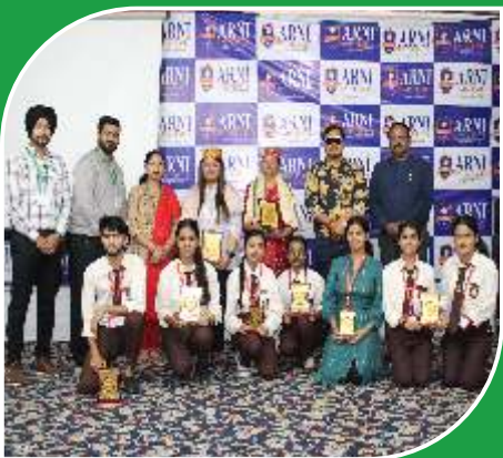
WORLD MALARIA DAY