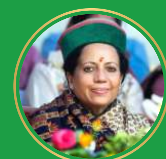
Smt. Pratibha Singh Indian Politician from Himachal Pradesh