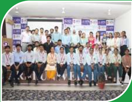
Virtual Lab Session By Experts Of IIT Delhi