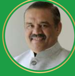
Shri Vijay Sampla Former Minister of State for Social Justice and Empowerment of INDIA