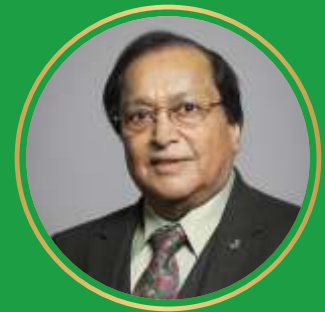
Lord Rami Ranger Member of Parliament House of Lords, United Kingdom