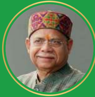
Shri Shiv Pratap Shukla Governor of Himachal Pradesh