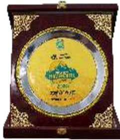
"HIMACHAL ICON" Award 2023