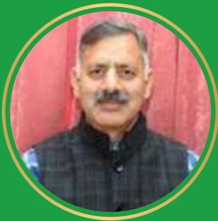
Shri Rajesh Dharmani Minister of Technical Education, Vocational and Industrial Training of Himachal Pradesh