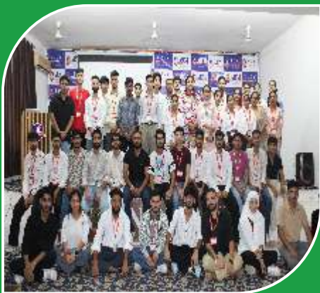
WORLD ANIMAL DAY