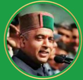
Shri Jai Ram Thakur Former Chief Minister of Himachal Pradesh