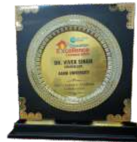
Education Excellence Conclave 2025