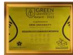
"GREEN UNIVERSITY" Award 2022 Indo-American University Network, U.N. New York