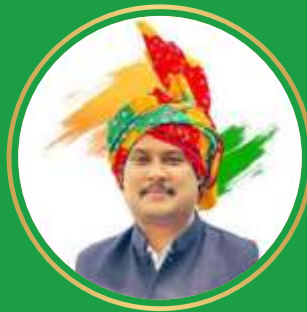
Shri Yadvinder Goma Minister for Ayush, Law & Legal, Youth Services & Sports, Govt. of Himachal