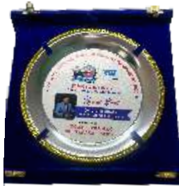
"4TH NTPC NATIONAL RANKING ARCHERY TOURNAMENT-2025"