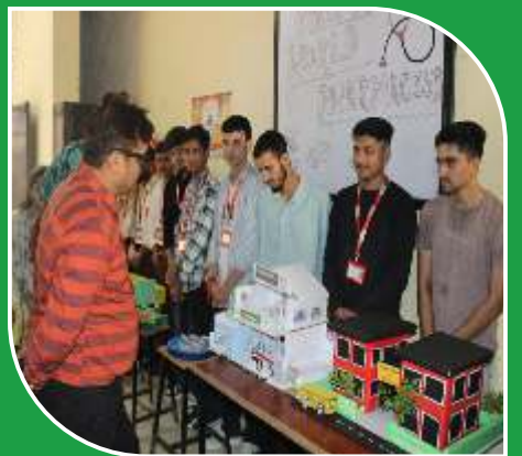
WORLD PHARMACISTS DAY