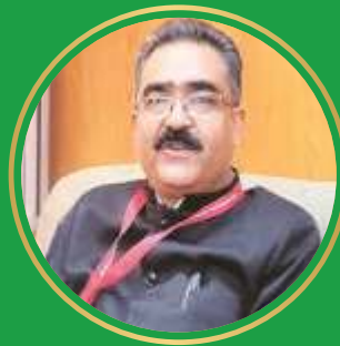
Shri Bikram Singh Former Industry Minister of Himachal Pradesh