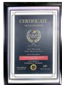
"FAST RISING & EMERGING UNIVERSITY" In North India at Baku (Azerbaijan)