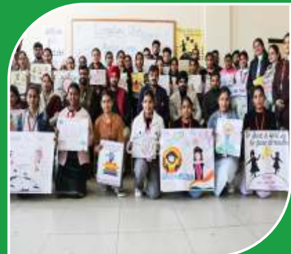
NATIONAL GIRL'S CHILD DAY