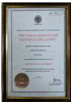
Admitted by the executive council as "INSTITUTIONAL MEMBER" of the Society