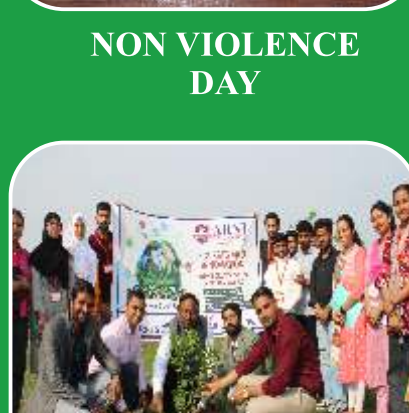
INTERNATIONAL FOREST DAY