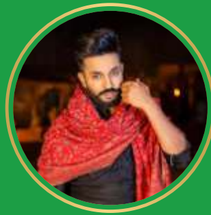
Dilpreet Dhillon Indian Singer and Actor