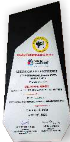
"4th ENTREPRENEUR & ACHIEVER" Award 2023