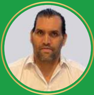
Shri Dalip Singh Rana (Great Khali) Former Indian Professional Wrestler