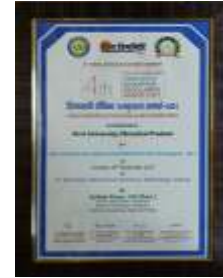
"BEST UNIVERSITY" With Highest Social Impact of the Year 2021