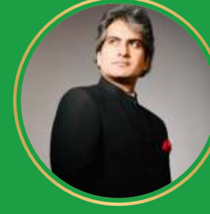
Shri Sudhir Chaudhary Editor of National News Channel Aaj Tak