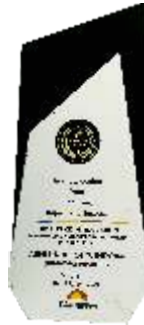
"EXCELLENCE IN EDUCATION" Award 2024